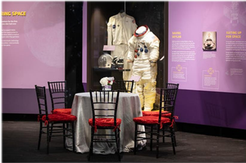
NASA Glenn Visitor Center

Explore the past, present, and future of human space exploration. Look inside the actual 1973 Skylab 3 Apollo Command Module, experience a multi-media trip through landmark moments in space history, see artifacts from John Glenn's February 20, 1962 Friendship 7 mission, check out a real moon rock and more! Features the Discover Stage, perfect for small gatherings and presentations.