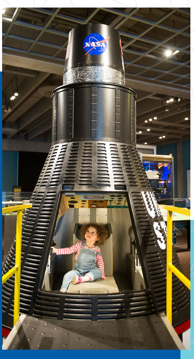
NASA Glenn Visitor Center Included with general admission